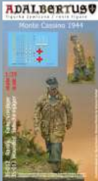
Figure and Instruction are ©Adalbertus Wojciech Bułhak 2009

All rights reserved. Any copying of any part of the figure or text or original drawings of instruction without written permission is prohibited. Unchanged and complete instruction may be distributed freely. Archival photos from Bundesarchiv are used under Wikimedia Commons licence CC-BY-SA