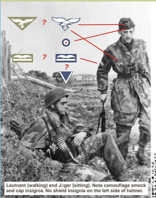
Leutnant (walking) and Jäger (sitting). Note camouflage smock and cap insignia. No shield insignia on the left side of helmet.