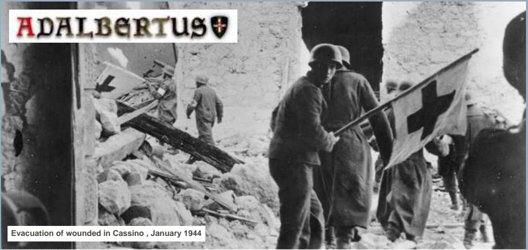
Evacuation of wounded in Cassino , January 1944

Bundesarchiv, Bild 183-J26141 Foto: Zscheile | 1944 Anfang